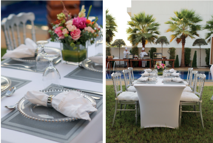
TYPE 2 45 AED